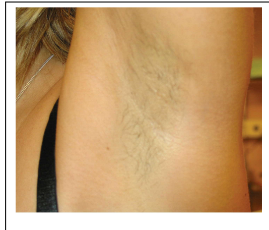
After 3 treatments